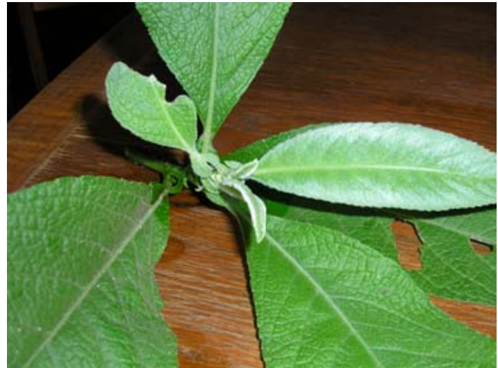
Left: Curcuma longa is a lobster shaped rhizome Top: Blumea balsamifera

More than half of the medicinal plants mentioned by our interviewees are for restoring the normal health of the young woman according to the sacred motto, you di, mi heng, "to be well is to have strength". As well as fortifying soups made of rice, chicken, ginger and salt, she spends her days sipping drinks made from kok deua pong ( Ficus hispida ), kheua ngou hao ( Toddalia asiatica ), ya nang ( Tiliacora triandra ), dok kè lao ( Marka mia stipulata ), dok sièo ( Bauhinia purpurea ). A tea made from the rhizome of kha khom , or "bitter galangal" ( Alpinia bracteata ) is strongly recommended. To return the colour to her cheeks,