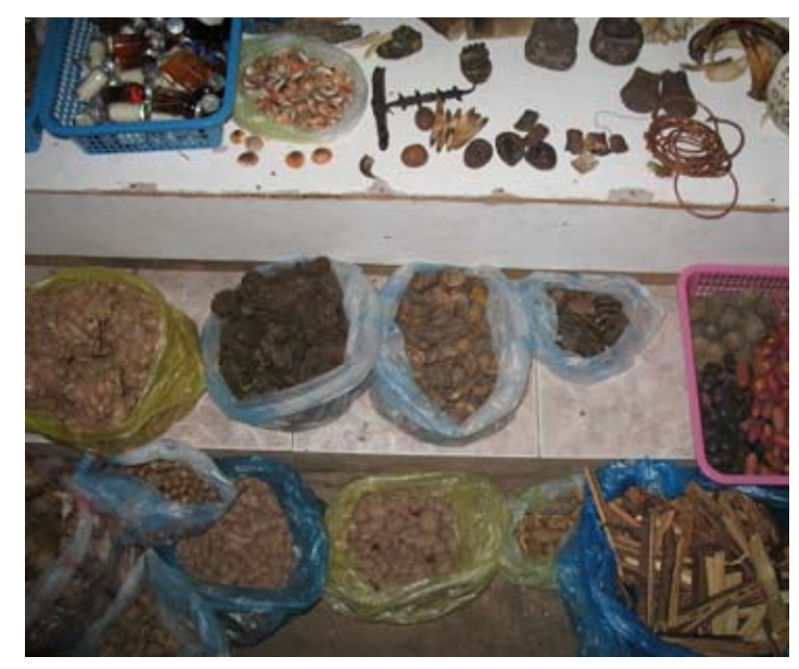
Various medicinal plants and talismans are sold in the market

These "simples", as medicines were once called, are not as simple as they might seem because they are bound up in the way of life, in philosophy, and in mysticism. In Laos, a large part of the population have no choice but plant therapies whose efficacy is linked directly to animist and Buddhist beliefs. Every village has its mò ya , a plant specialist, but also a mò mon, who knows the mantras, and even a mo phi, who knows how to call the spirits. As well, in each house there is always a knowledgeable person who knows how to make a diagnosis and prescribe the right medicine. Medicinal plants can also be bought in the markets, in the form of dried leaves, brown bark and twisted roots of mysterious provenance that are difficult to identify. Our purpose here is not to evaluate this therapy but to explore the rich botanical knowledge which demonstrates how closely Lao people lived to their natural environment.