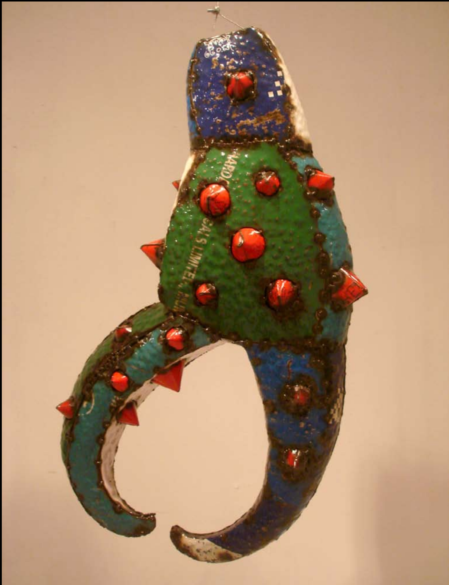
Suwit Maprajuab Crab Claw 2

98 x 55 x 20 cm, discarded oil tanks, 2011