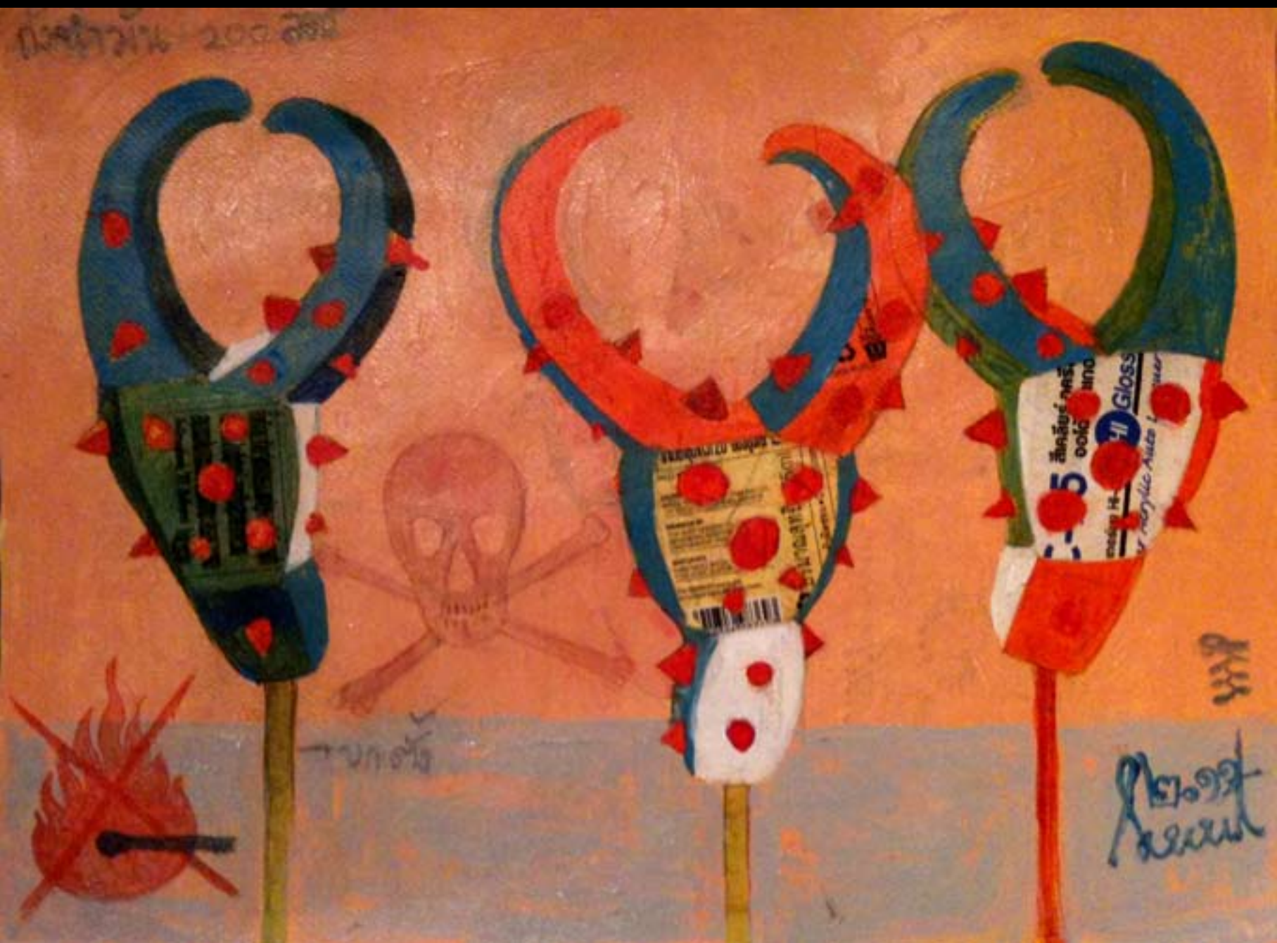
Suwit Maprajuab Sketch, 2011