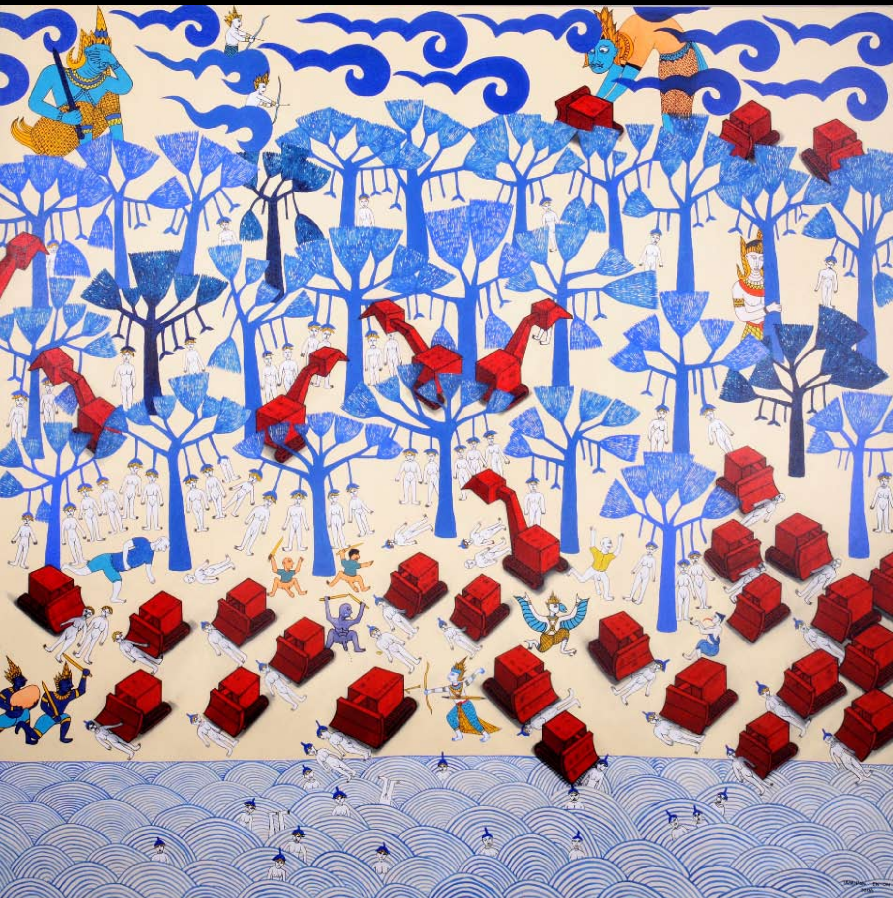
Tanupon En-on Out With The Old, In With The New 150 x 150 cm, acrylic on canvas, 2007