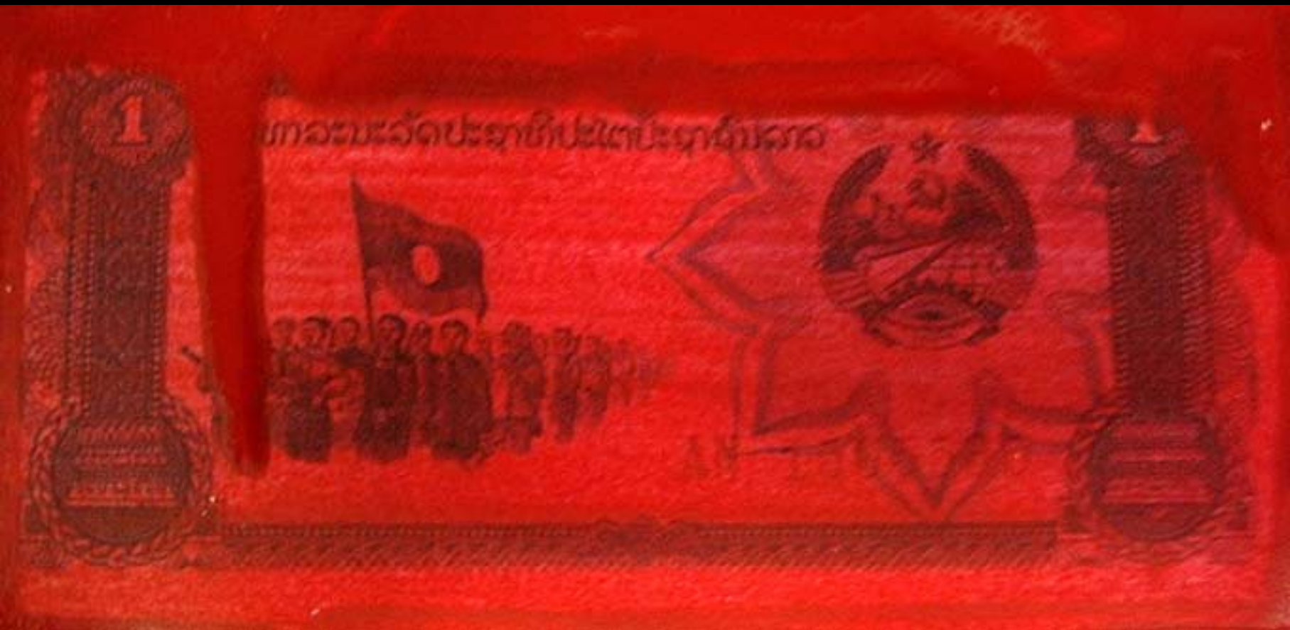
Pornprasert Yamazaki Sketch with buffalo blood, 2011