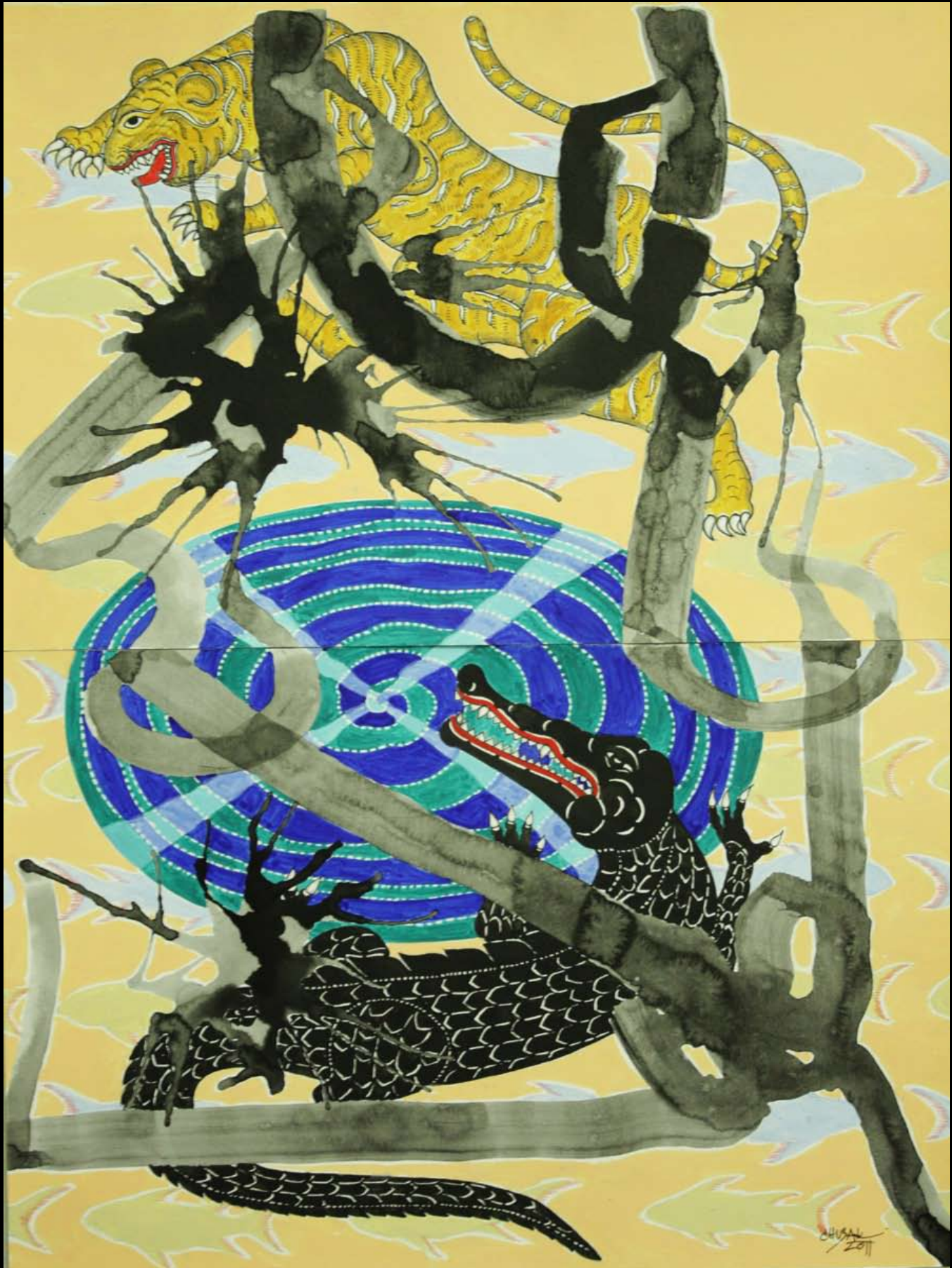
Chusak Srikwan Tiger & Crocodile 59 x 42 cm, Acrylic on paper, 2011