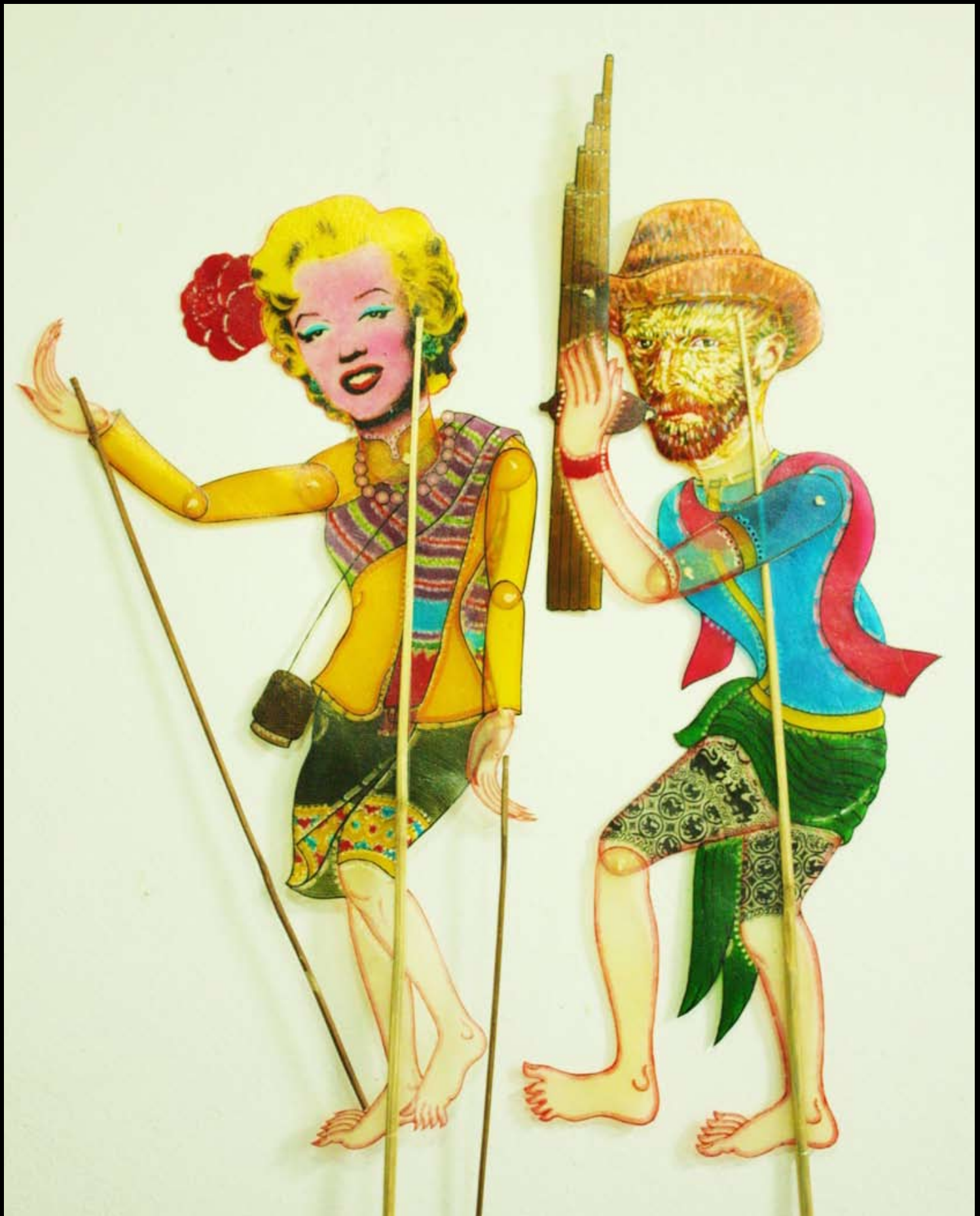
Chusak Srikwan The people funny of Northeast Thailand No. 2 67 x 30 cm (man), 60 x 30 cm (woman), Leather carving, 2011