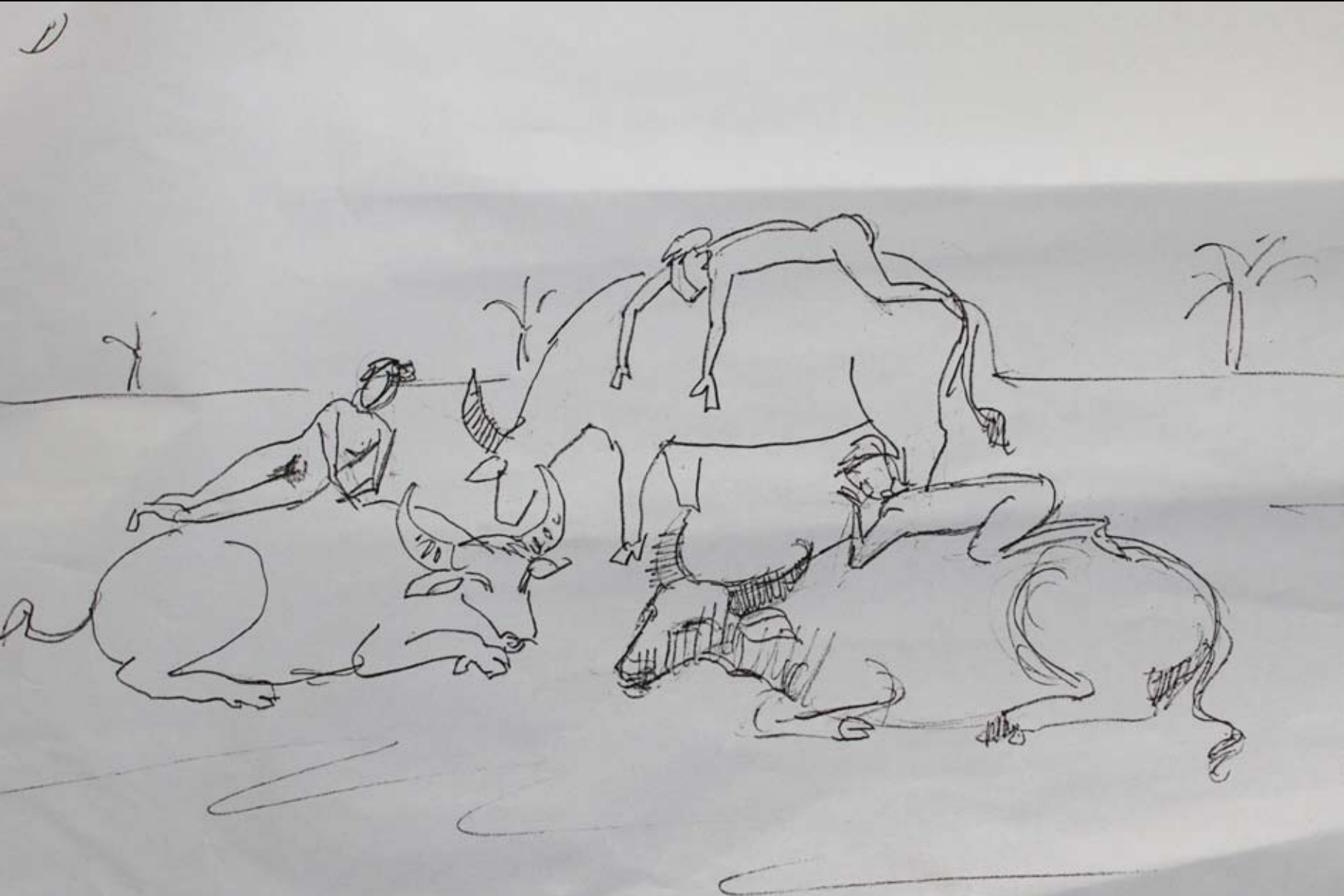
Maitree Siriboon Sketch, 2010