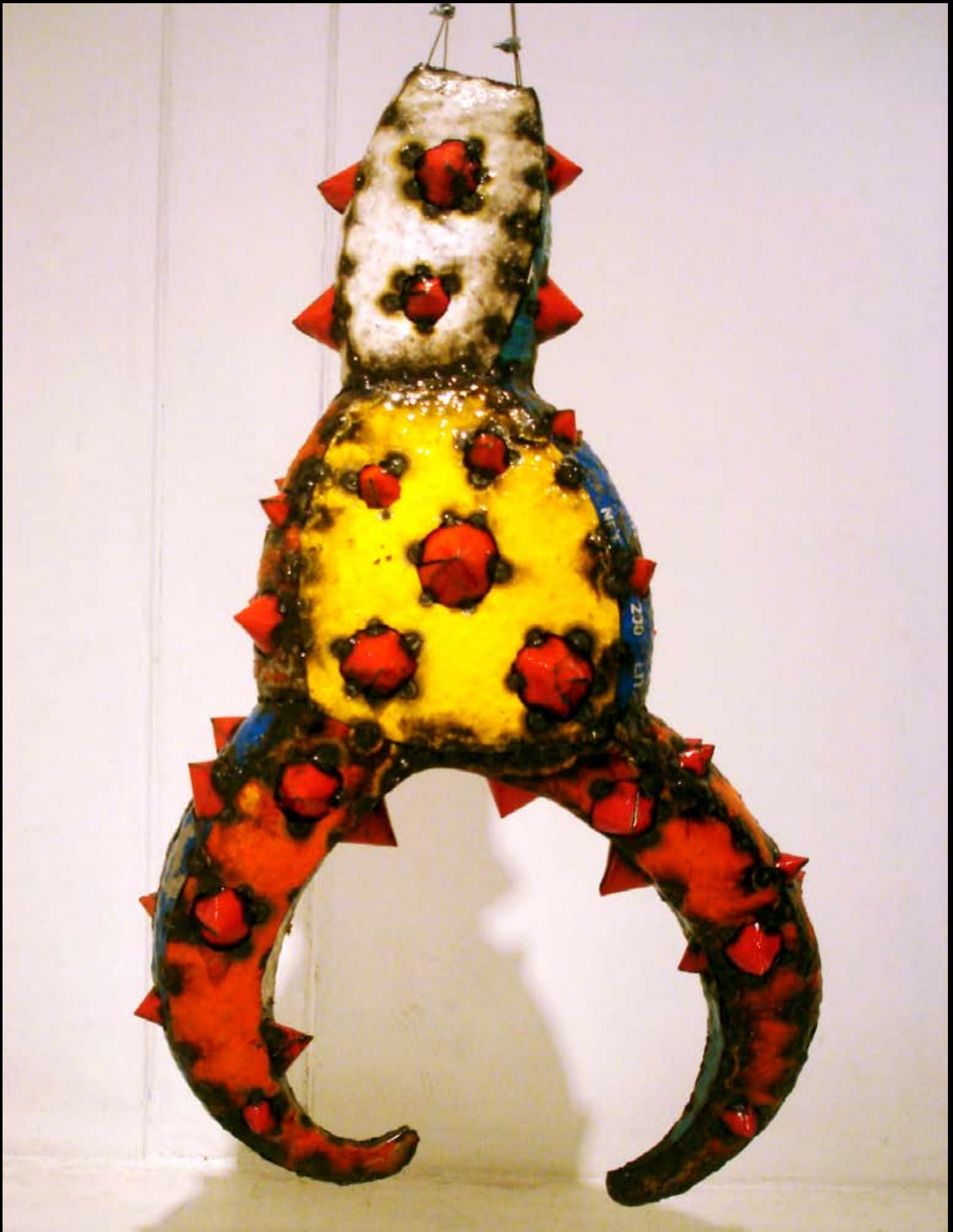
Suwit Maprajuab Crab Claw 1

109 x 65 x 24 cm, discarded oil tanks, 2011