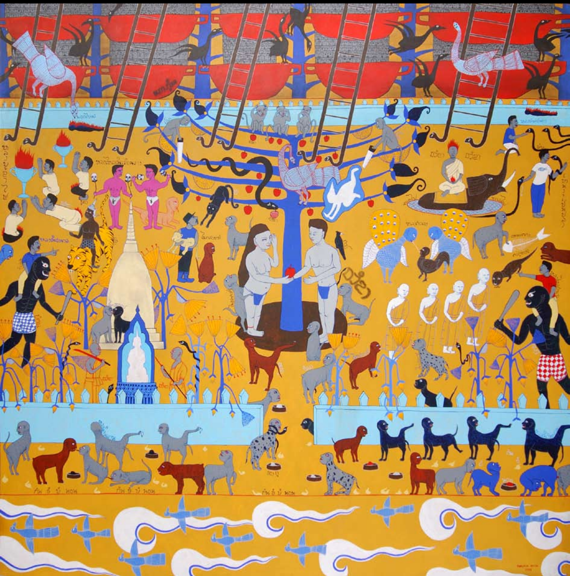
Tanupon En-on Wipa 200 x 200 cm, acrylic on canvas, 2008