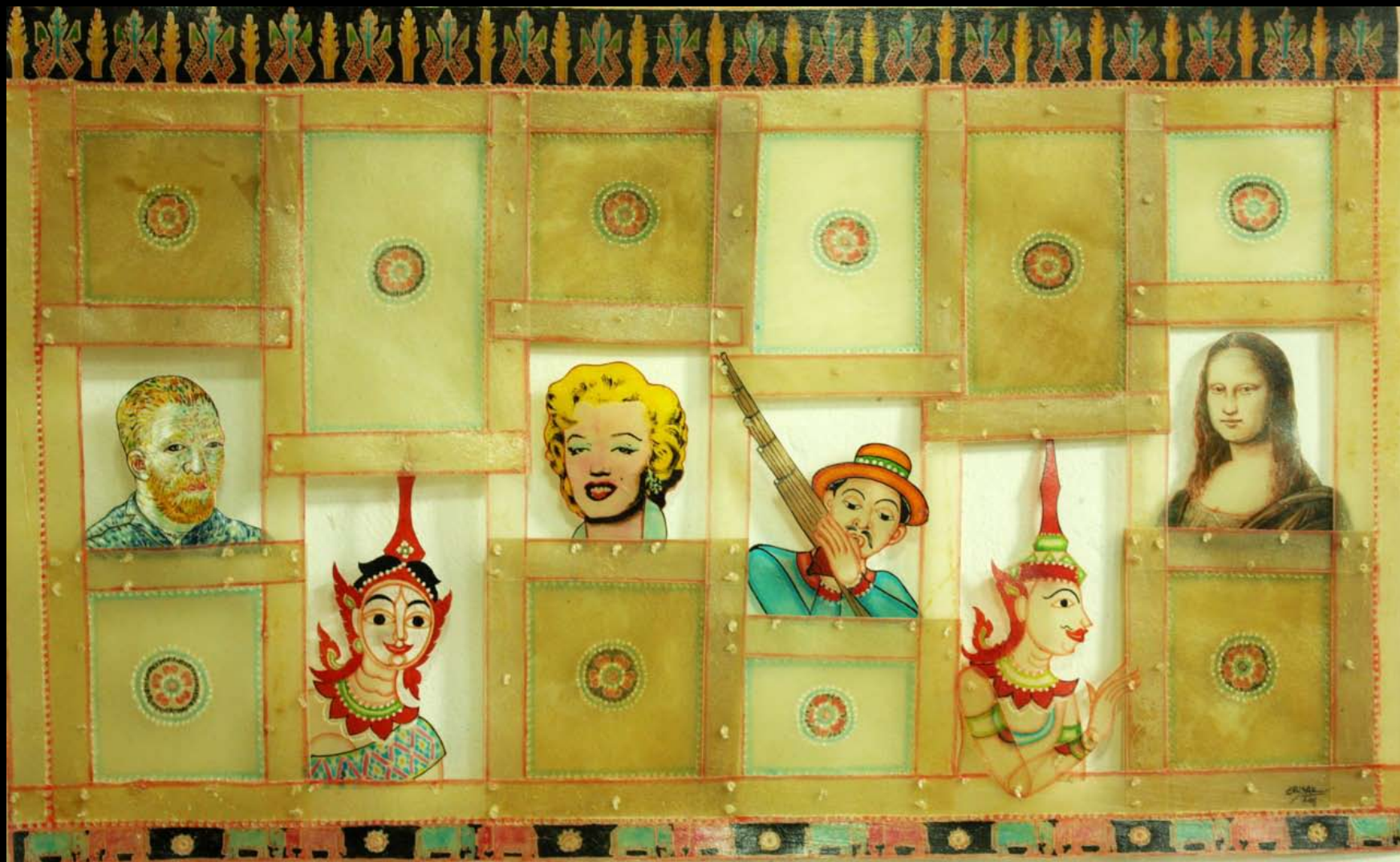
Chusak Srikwan Artist's Home 88 x 55 cm, Carved Leather, 2011