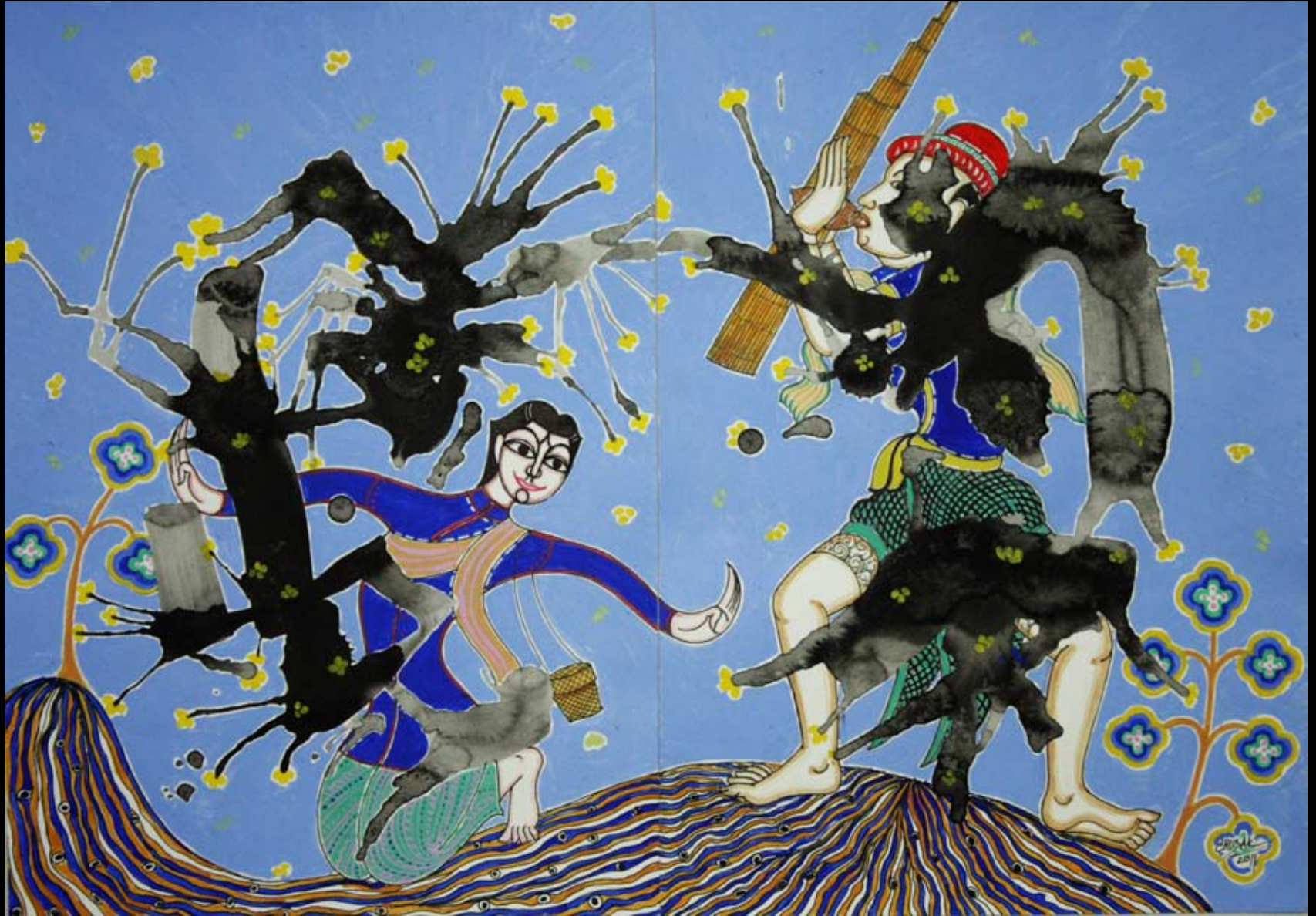
Chusak Srikwan The people funny of Northeast Thailand No. 1 59 x 42 cm, Acrylic on paper, 2011