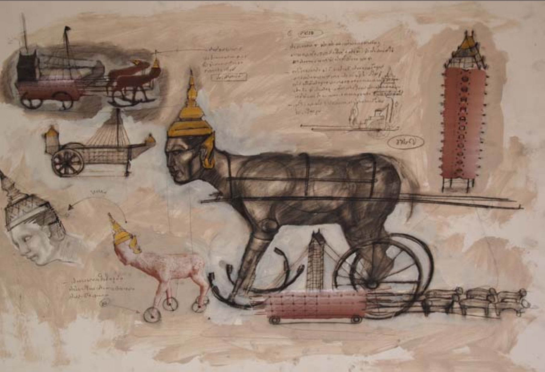
Crayon & Acrylic on paper, 109 X 79 cm, 2011