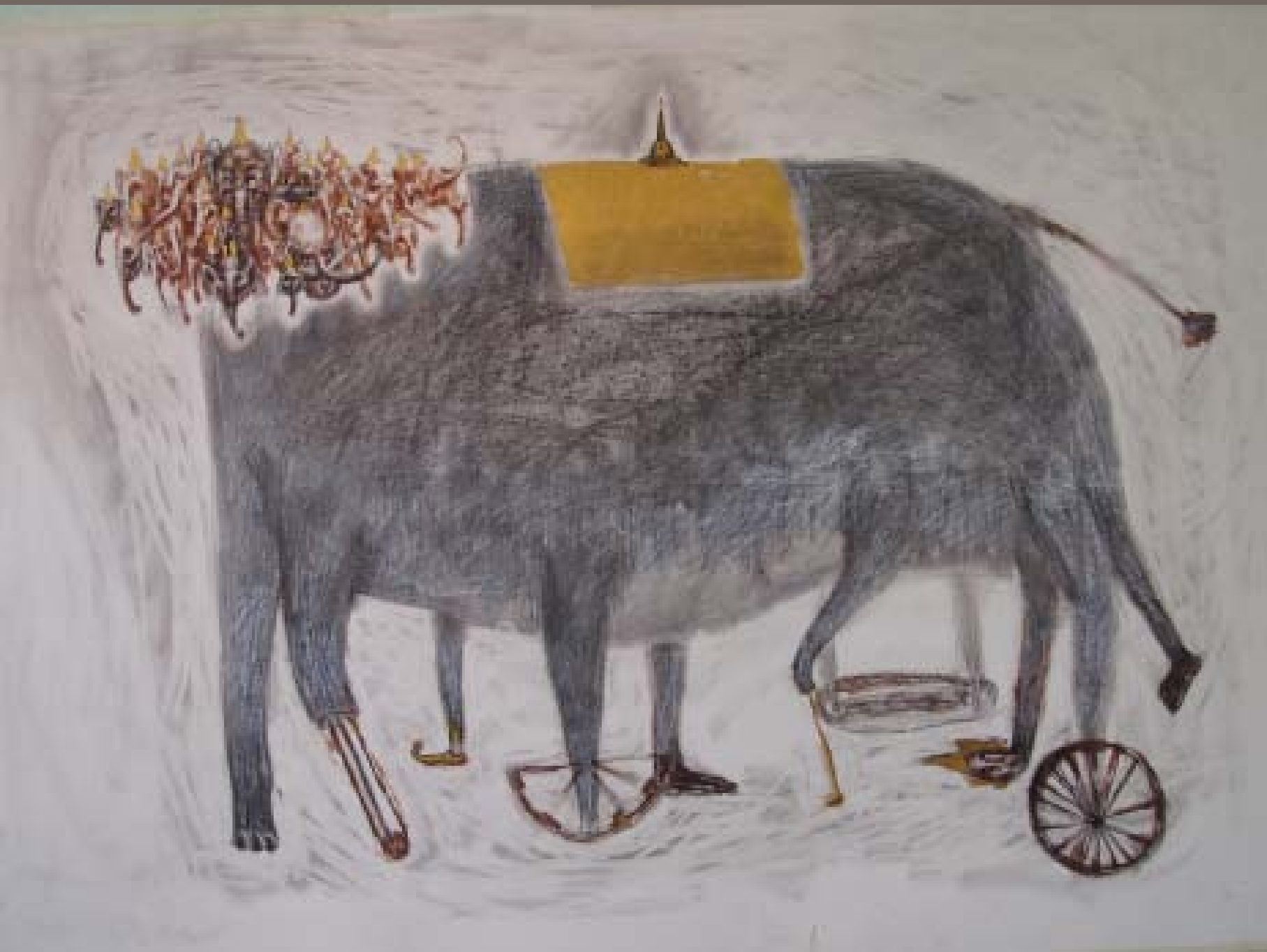
Crayon & Acrylic on paper, 109 X 79 cm, 2012