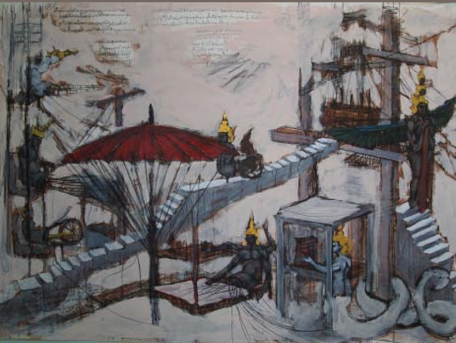
Crayon & Acrylic on paper, 109 X 79 cm, 2012