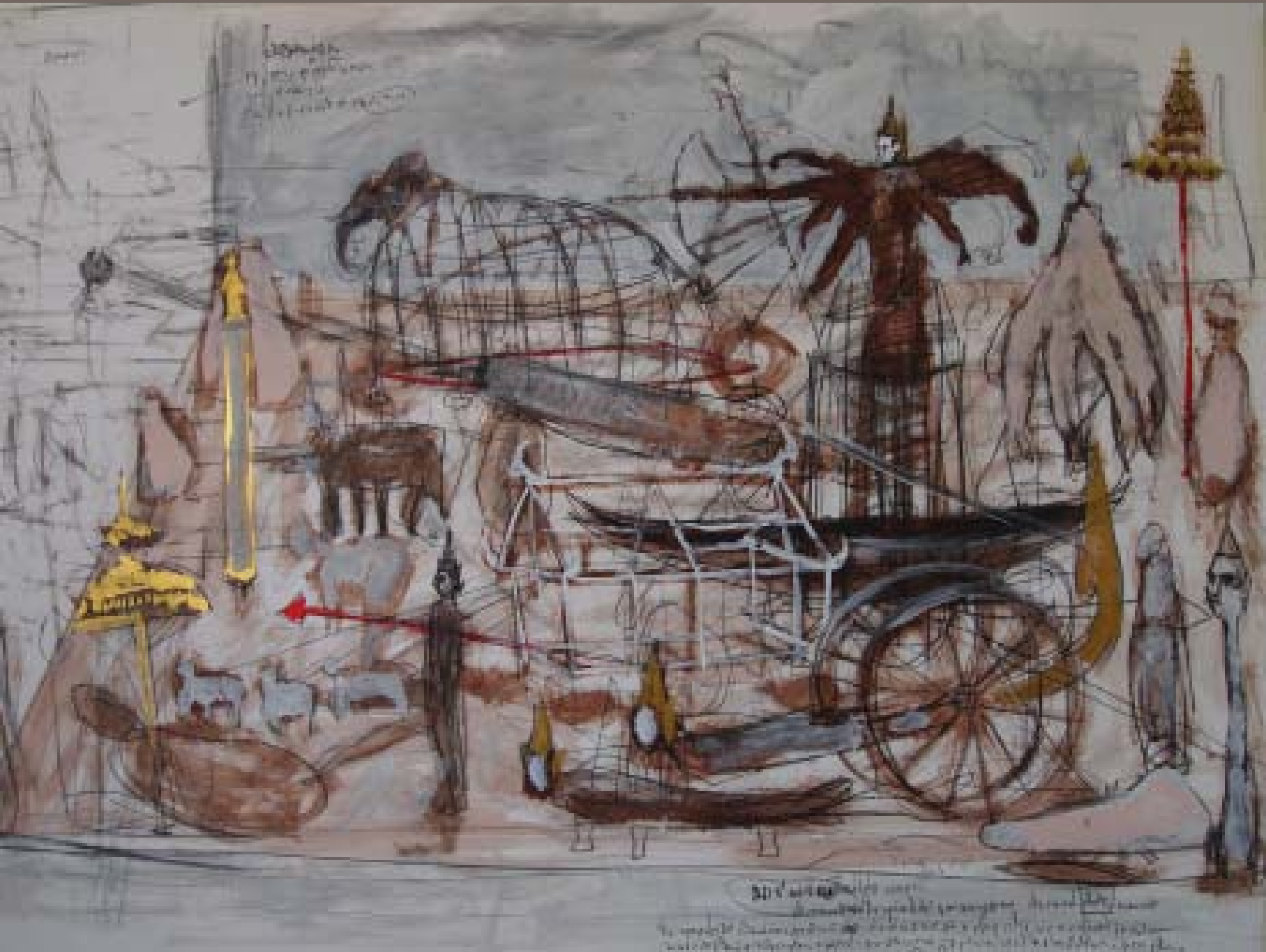
Crayon & Acrylic on paper, 109 X 79 cm, 2012