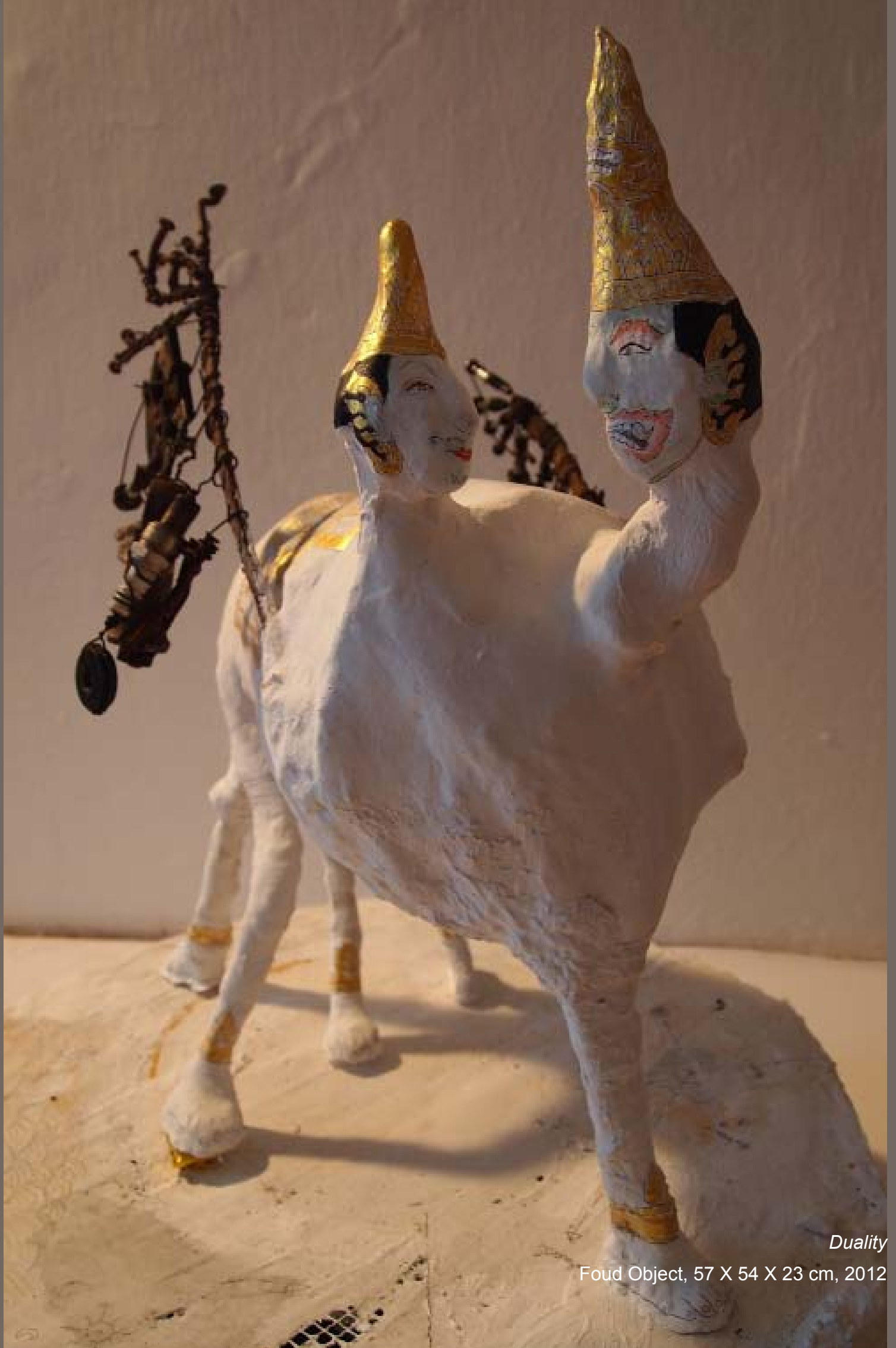
Duality Foud Object, 57 X 54 X 23 cm, 2012