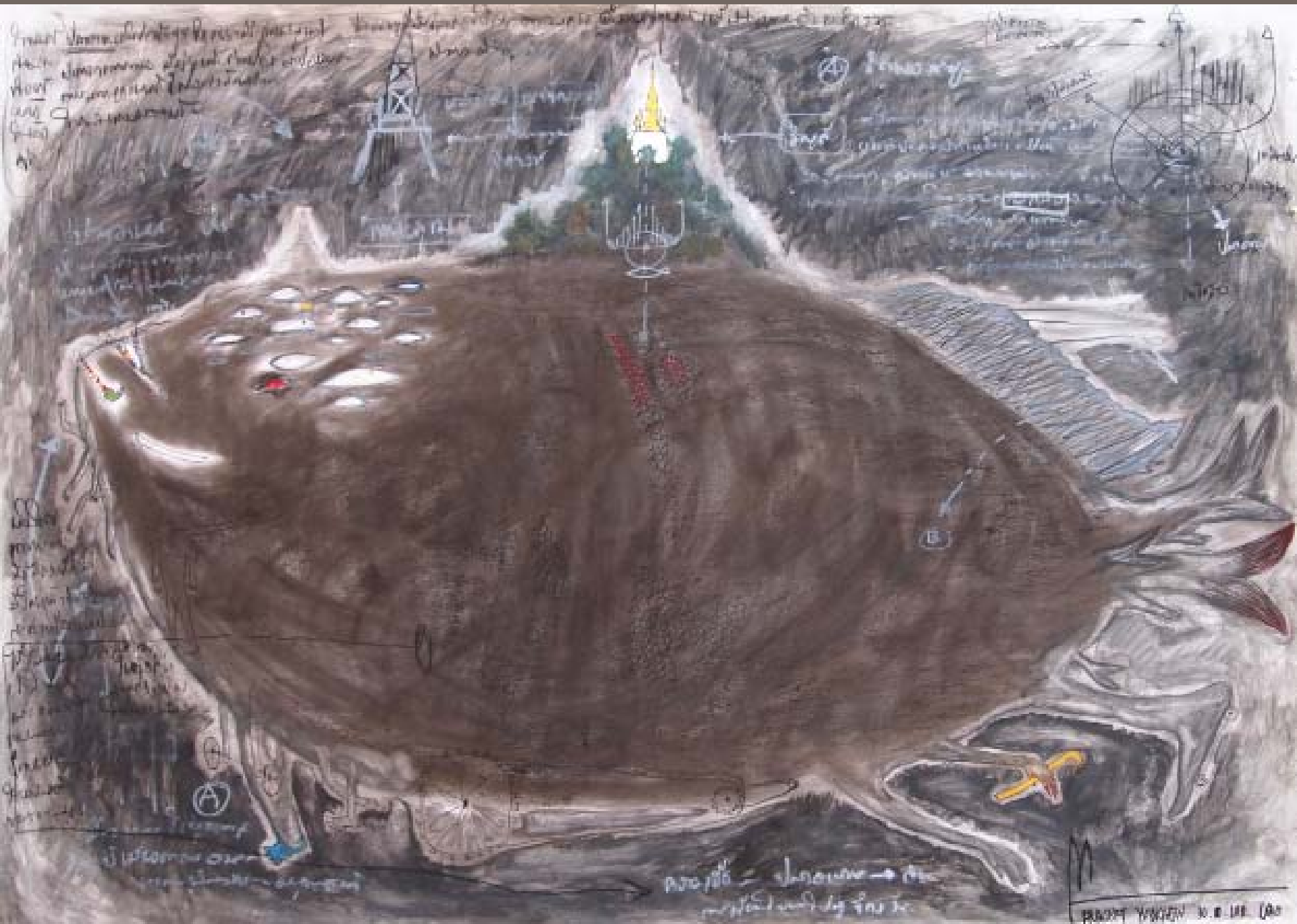
Phousy Mountain on the Big Fish, Luang Prabang, Laos

Crayon & Acrylic on paper, 109 X 79 cm, 2012