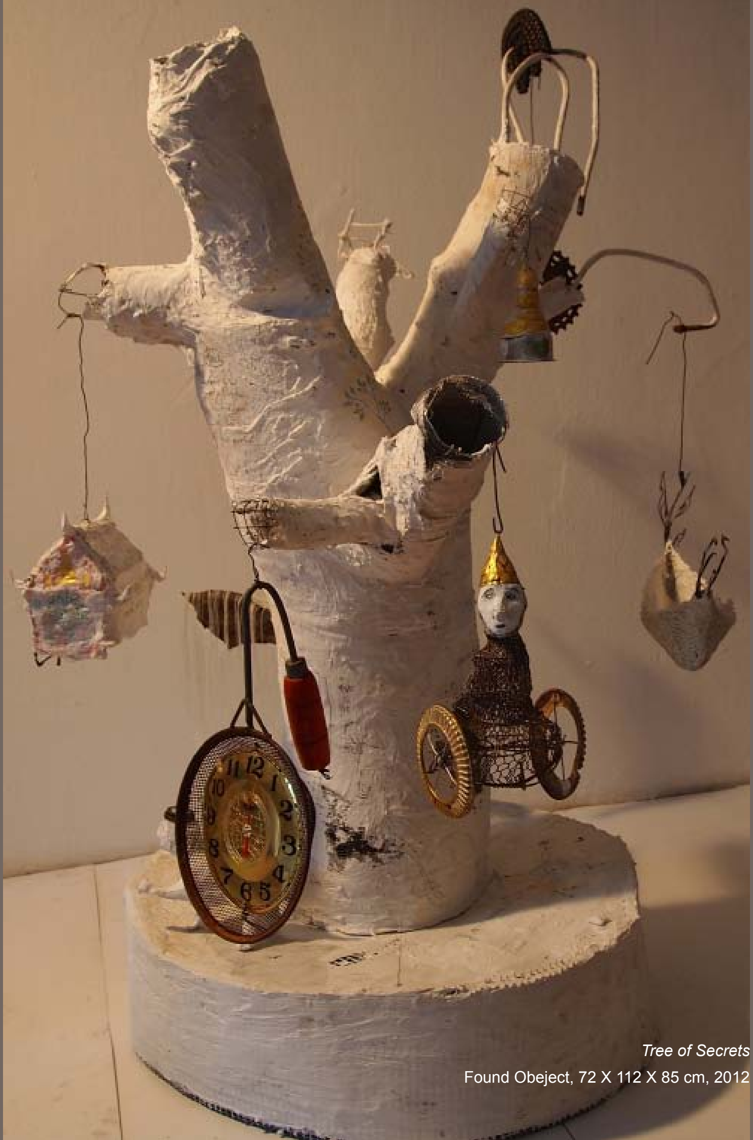
Tree of Secrets Found Obeject, 72 X 112 X 85 cm, 2012