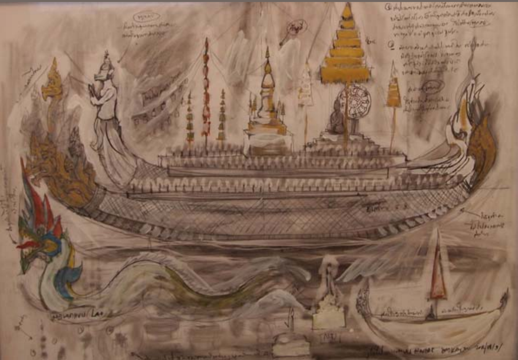
Fire Boat, Luang Prabang, Laos Crayon & Acrylic on paper, 109 X 79 cm, 2012