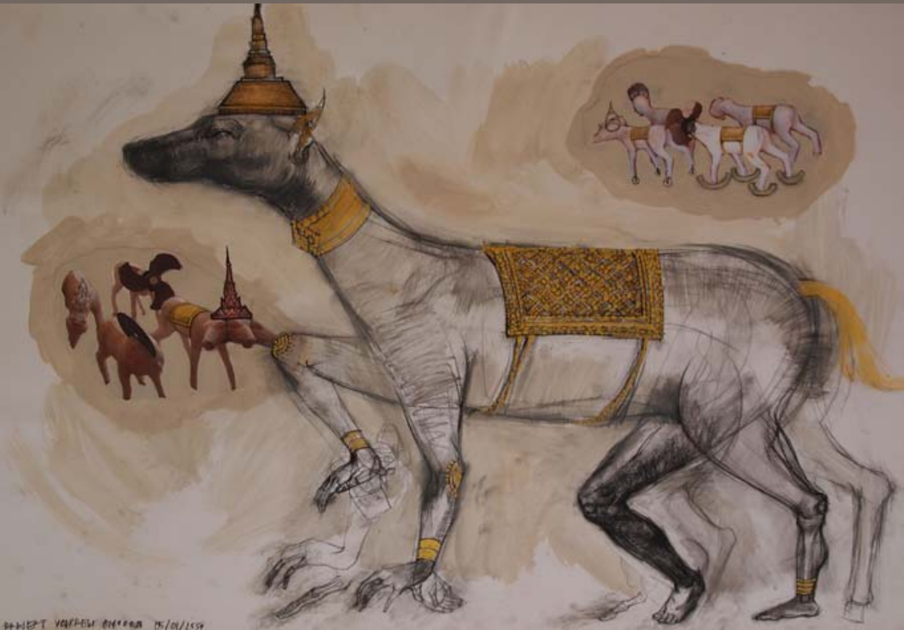
Crayon & Acrylic on paper, 109 X 79 cm, 2011