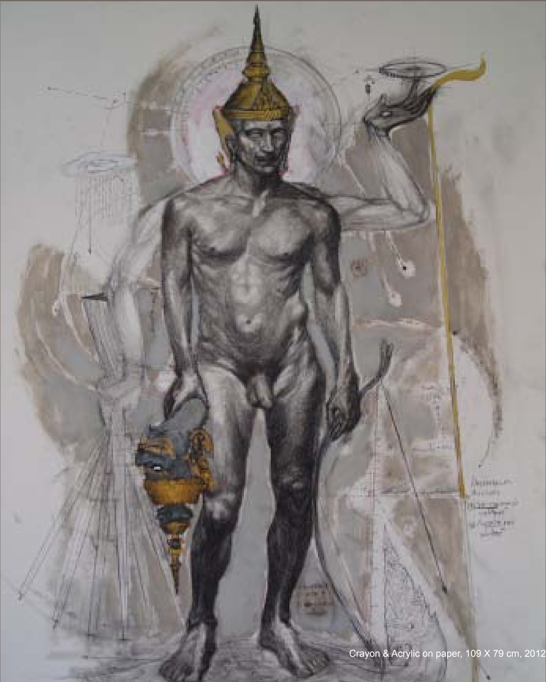
Crayon & Acrylic on paper, 109 X 79 cm, 2012