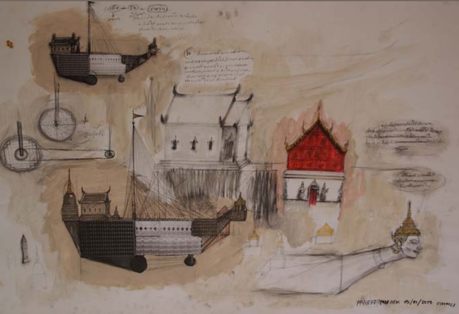
Crayon & Acrylic on paper, 109 X 79 cm, 2011