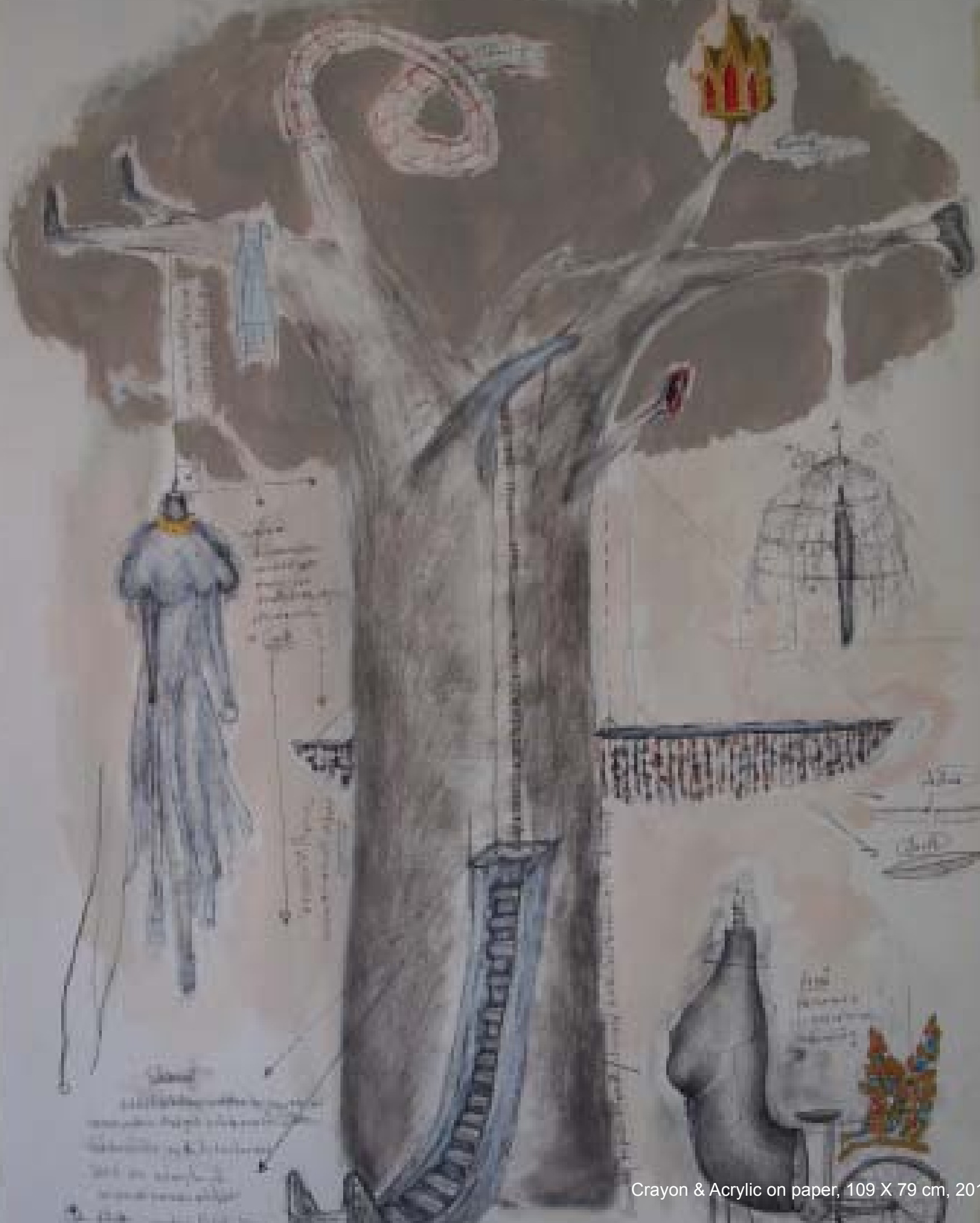
Crayon & Acrylic on paper, 109 X 79 cm, 2012