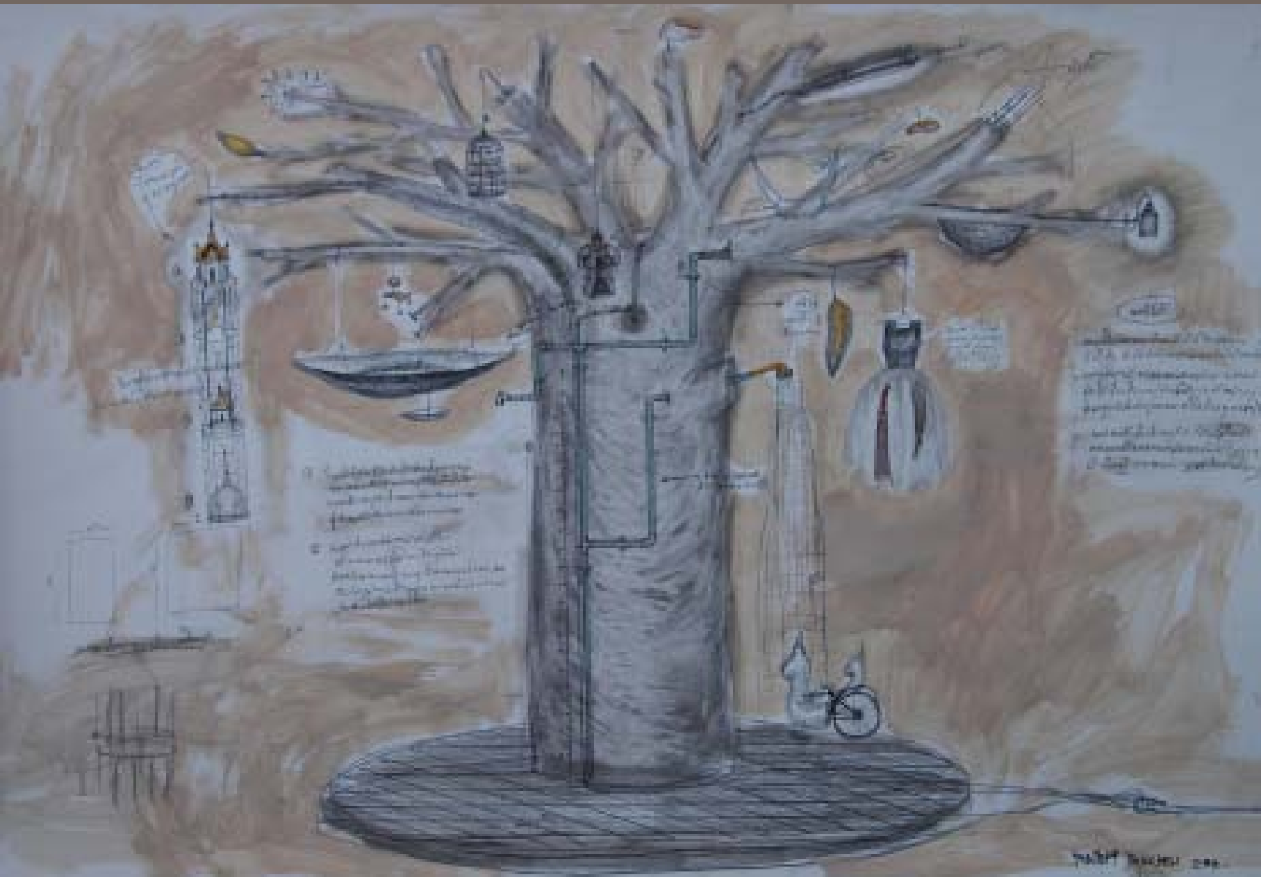
Crayon & Acrylic on paper, 109 X 79 cm, 2012