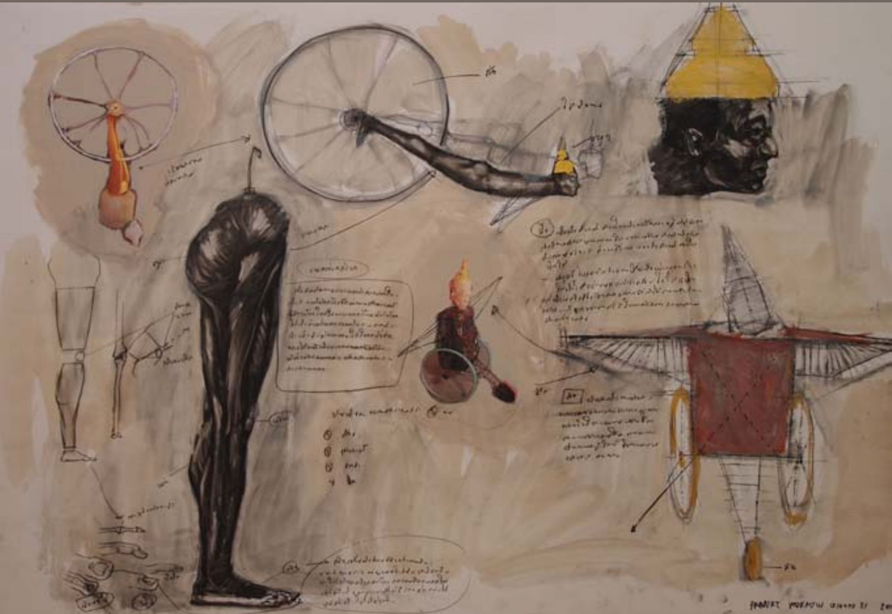
Crayon & Acrylic on paper, 109 X 79 cm, 2011