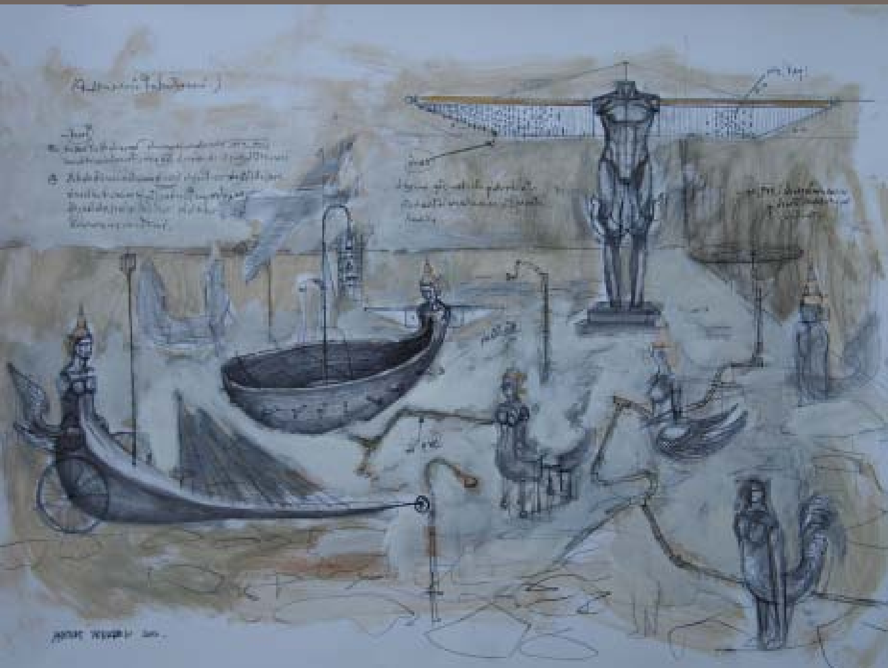
Crayon & Acrylic on paper, 109 X 79 cm, 2012